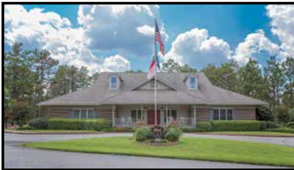
PINEHURST 910-235-0366 md@bolesfuneralhome.com