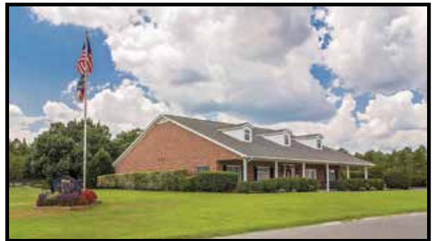
SEVEN LAKES 910-673-7300 md@bolesfuneralhome.com