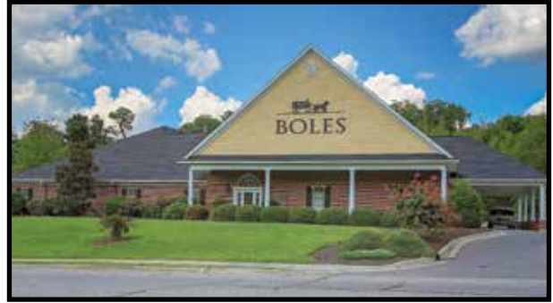
SOUTHERN PINES 910-692-6262 md@bolesfuneralhome.com